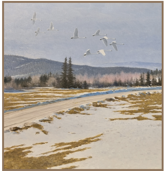
(COVER) Rebecca Korth, "Wren in Art", 2024, oil on gessoed hardboard; (LEFT PAGE) Derek Robertson, Golden Plover Field Sketches , 2023, watercolor on Frogmore paper; (ABOVE) Lennart Sand, Whooper Swans (detail) , 2024, oil on linen; (BELOW) Thomas Hill, Bird Parasites: Internal and External , 2024, mixed media

Watch Birds in Art artists at work as they demonstrate various techniques in the Museum's sculpture garden. Catch a glimpse of several creative processes and artistic mediums and ask questions as works of art come to life.